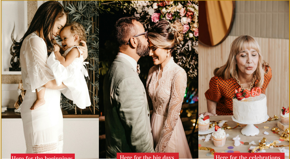
Here for the beginnings