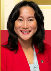
JEAN YIP Member of Parliament Scarborough—Agincourt